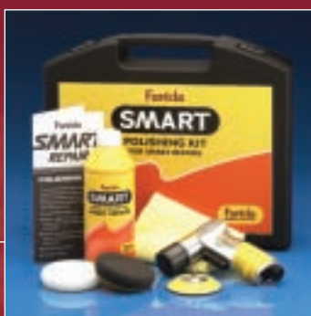
SMART Polishing Kit