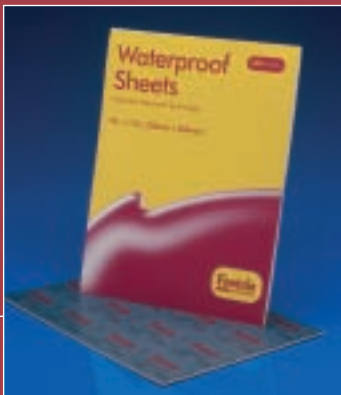
Waterproof Sheets - P1200/ P1500/ P2000