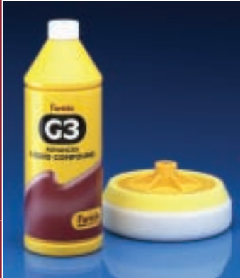
Advanced G3 Liquid Compound/ G3 Paste