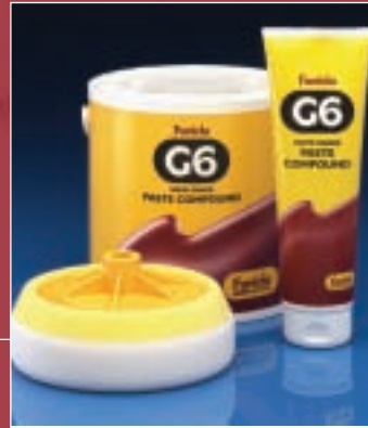
G6 Rapid Grade Paste