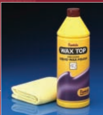
Wax Top Liquid Wax Polish

Advanced G Mop Polishing Foam (2 pk) Advanced G Mop Back Plate with Interface Pad 6" Advanced G Mop Finishing Cloth 3 - pack