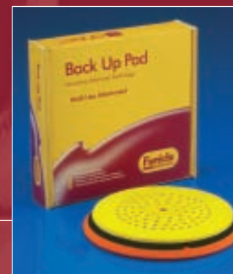
Back Up Pad

Product Information: The Farécla Back up Pad has 6 different attachments so it will fit most sanding machines world-wide. Its foam base also ensures an even pressure is distributed over the surface. 150mm diameter