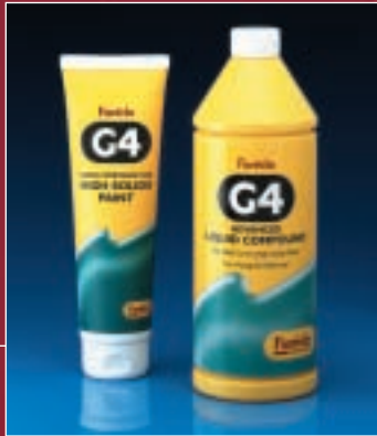
Advanced G4 Liquid/ G4 Paste