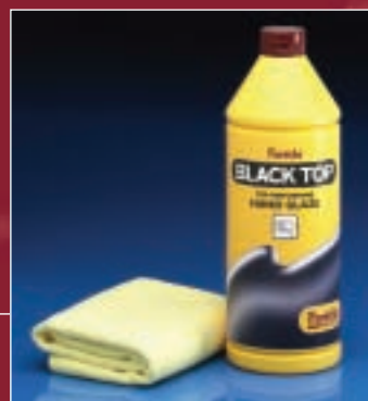
Black Top Hand Glaze

500ml Part No. WT-500 Litre Part No. WT-1000 1 US Gal Part No. WT-3785