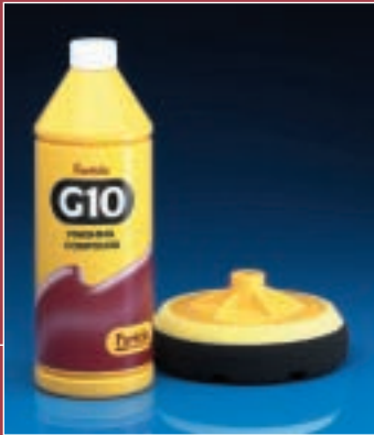
G10 Finishing Compound