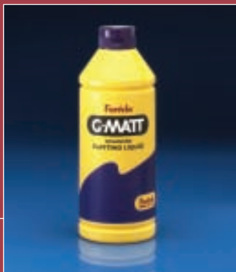
Advanced G Matt Flatting Liquid