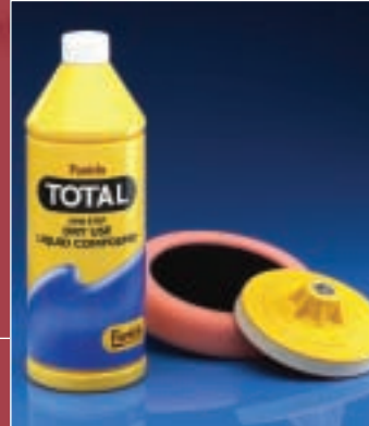
Total Dry-Use Compound