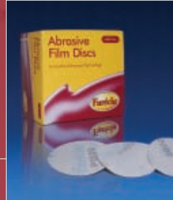
Abrasive Film Discs - 75mm

P1200 Part No. 1011200 P1500 Part No. 1011500 P2000 Part No. 1012000