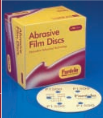
Abrasive Film Discs - 150mm

Product Information: Available in 3 grades P1200, P1500 and P2000, Farécla abrasive discs have a durable film backing and 7 holes for dust extraction 150mm in diameter. P1200 should be used for removal of orange peel and tougher defects. P1500 should be used for removal of general defects. P2000 should be used for removal of lighter defects. Recommended to be used with the Farécla Back Up Pad and Farécla Interface Pad. To achieve the best finish follow up with either Total or G3 compounds. Back Up Pad